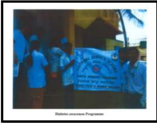
Diabetes awareness Programme