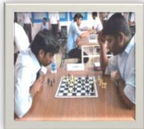
Glimpse of the Sports Event