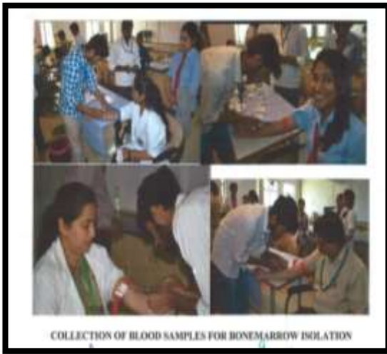
COLLECTION OF BLOOD SAMPLES FOR BONE MARROW ISOLATION