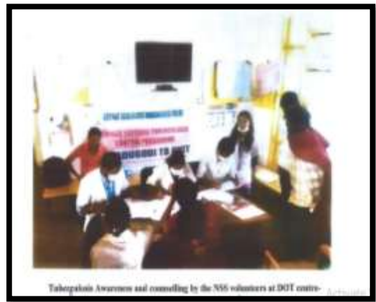
Tuberculosis Awareness and counselling by the NSS volunteers at DOT centre