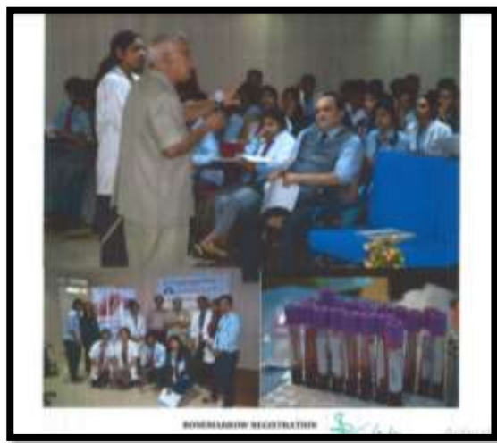
BONE MARROW REGISTRATION